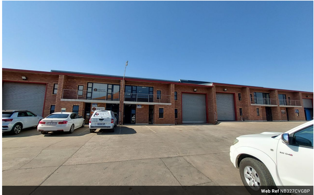
Web Ref NB327CVGBP

Office 40A Eden Meadows Complex 1 Van Riebeeck Avenue Greenstone 1609