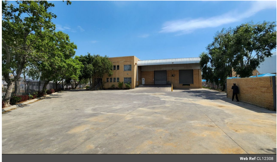
Web Ref CL12308

Office 40A Eden Meadows Complex 1 Van Riebeeck Avenue Greenstone 1609