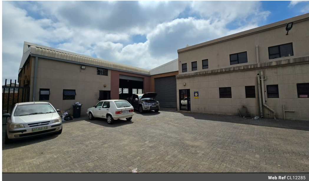
Web Ref CL12285

Office 40A Eden Meadows Complex 1 Van Riebeeck Avenue Greenstone 1609