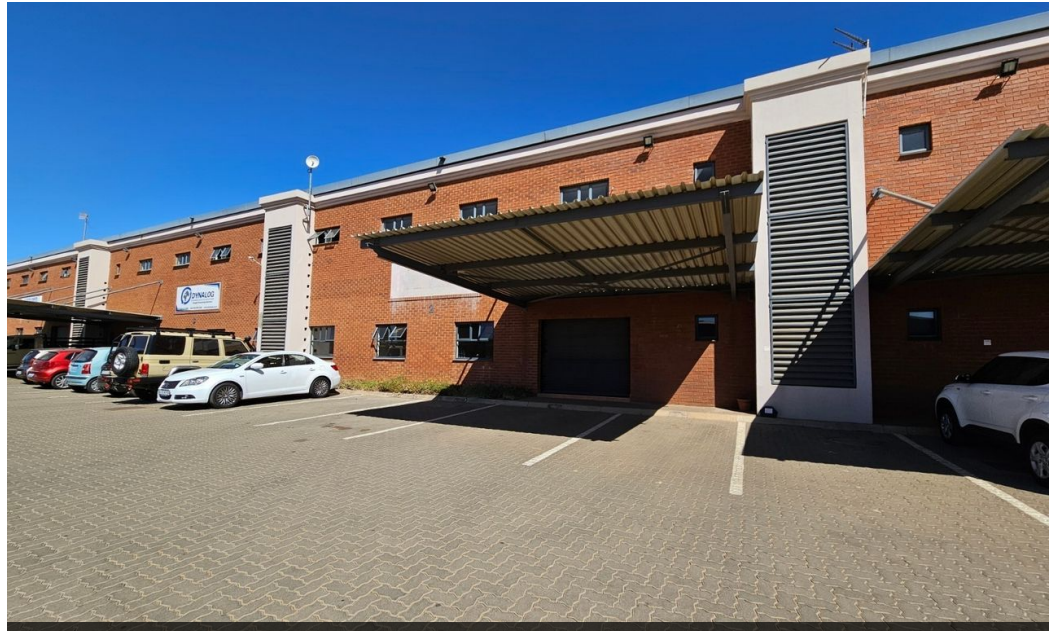
Web Ref CL12442

Office 40A Eden Meadows Complex 1 Van Riebeeck Avenue Greenstone 1609