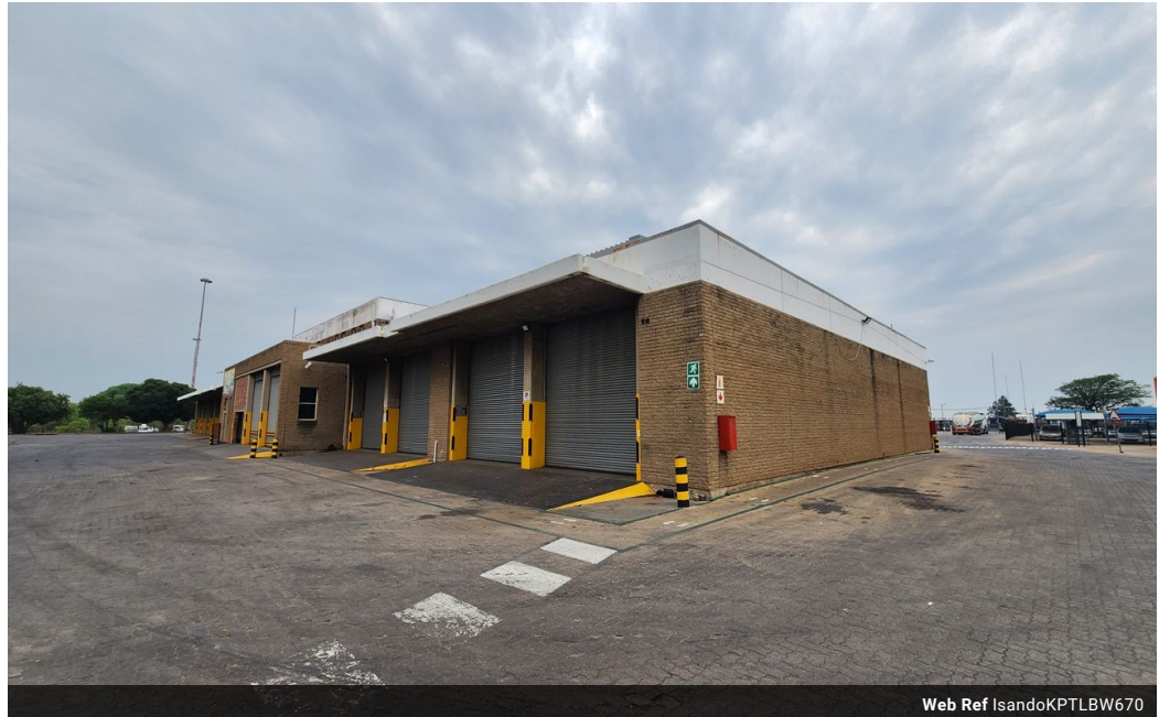
Web Ref IsandoKPTLBW670

Office 40A Eden Meadows Complex 1 Van Riebeeck Avenue Greenstone 1609