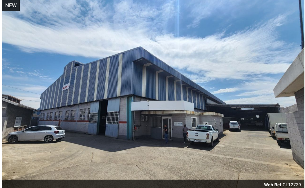
Web Ref CL12739

Office 40A Eden Meadows Complex 1 Van Riebeeck Avenue Greenstone 1609