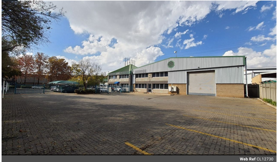
Web Ref CL12730