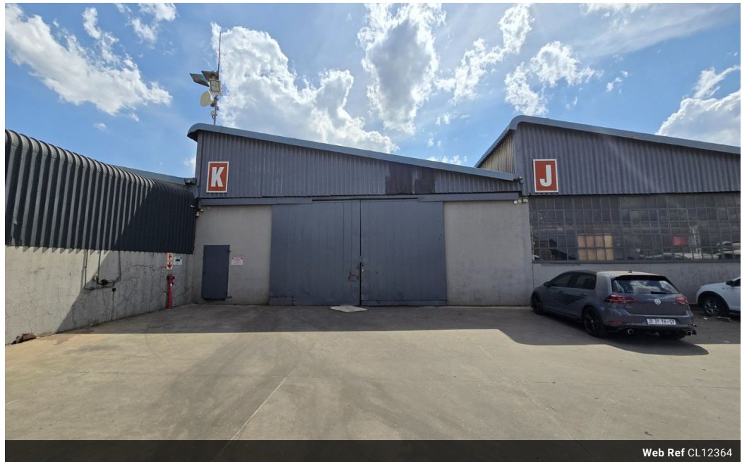
Web Ref CL12364

Office 40A Eden Meadows Complex 1 Van Riebeeck Avenue Greenstone 1609