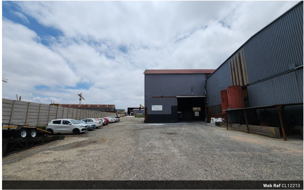
Web Ref CL12213

Office 40A Eden Meadows Complex 1 Van Riebeeck Avenue Greenstone 1609