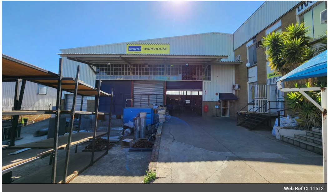
Web Ref CL11513

Office 40A Eden Meadows Complex 1 Van Riebeeck Avenue Greenstone 1609