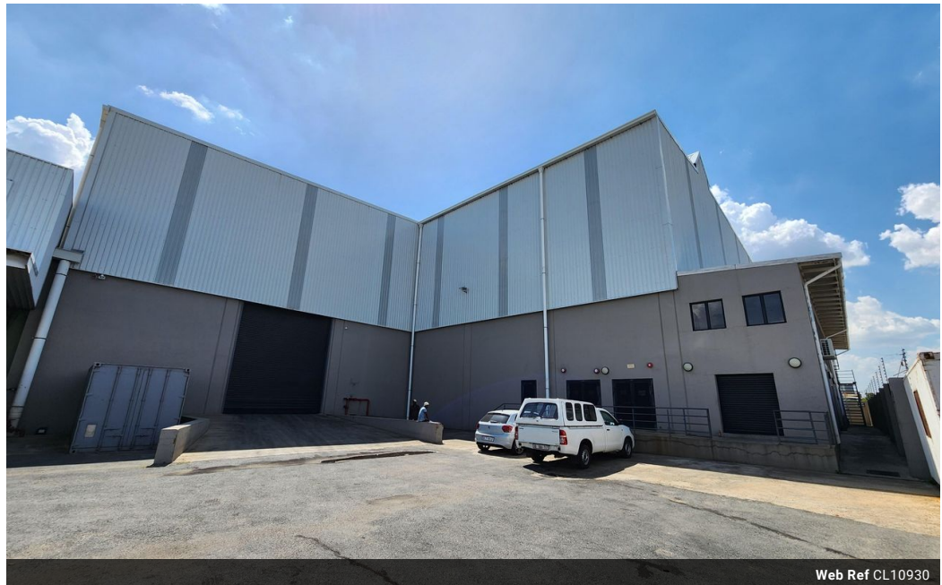
Web Ref CL10930

Office 40A Eden Meadows Complex 1 Van Riebeeck Avenue Greenstone 1609