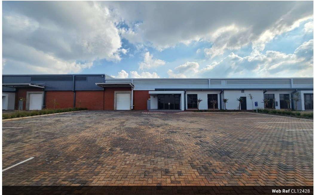
Web Ref CL12428

Office 40A Eden Meadows Complex 1 Van Riebeeck Avenue Greenstone 1609