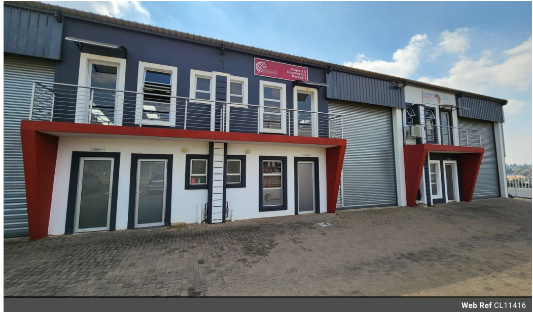
Web Ref CL11416

Office 40A Eden Meadows Complex 1 Van Riebeeck Avenue Greenstone 1609