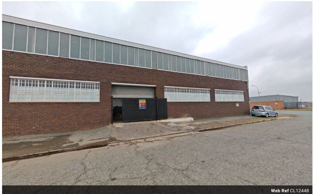
Web Ref CL12448

Office 40A Eden Meadows Complex 1 Van Riebeeck Avenue Greenstone 1609