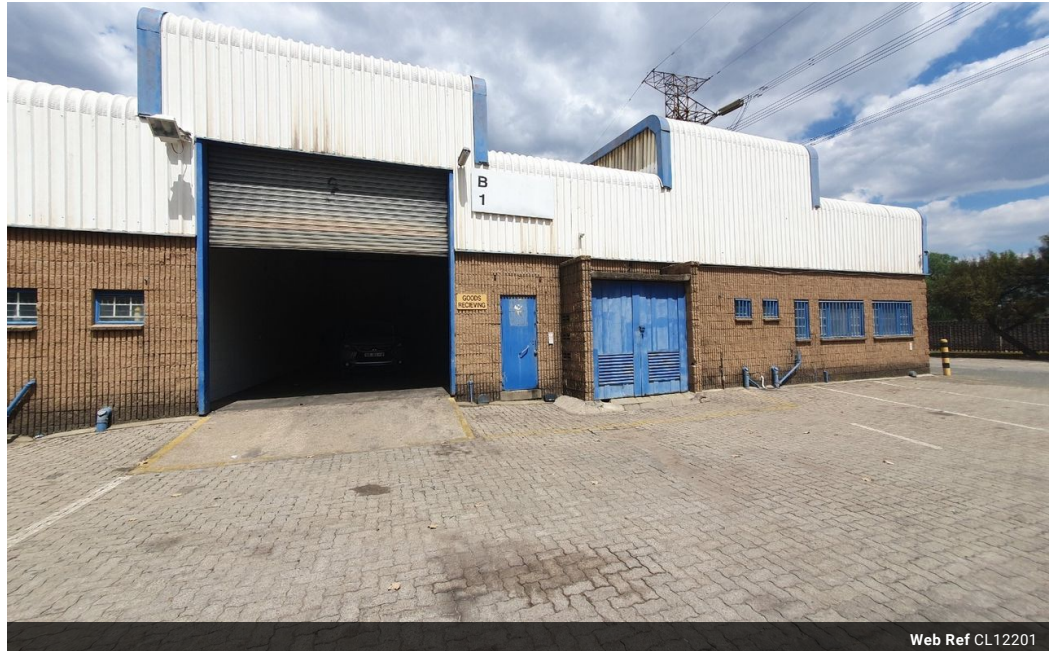
Web Ref CL12201

Office 40A Eden Meadows Complex 1 Van Riebeeck Avenue Greenstone 1609