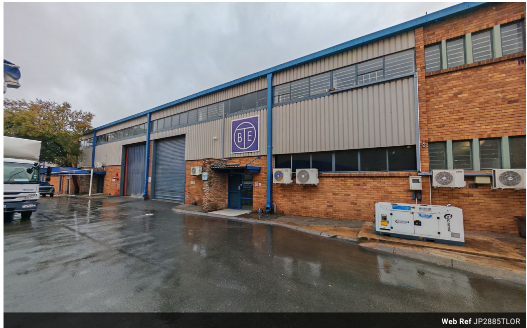
Web Ref JP2885TLOR

Office 40A Eden Meadows Complex 1 Van Riebeeck Avenue Greenstone 1609