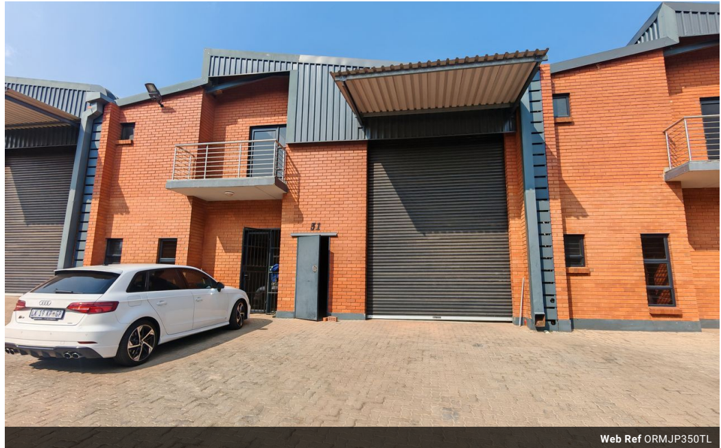
Web Ref ORMJP350TL

Office 40A Eden Meadows Complex 1 Van Riebeeck Avenue Greenstone 1609