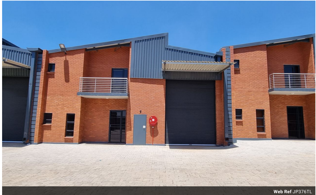
Web Ref JP376TL

Office 40A Eden Meadows Complex 1 Van Riebeeck Avenue Greenstone 1609