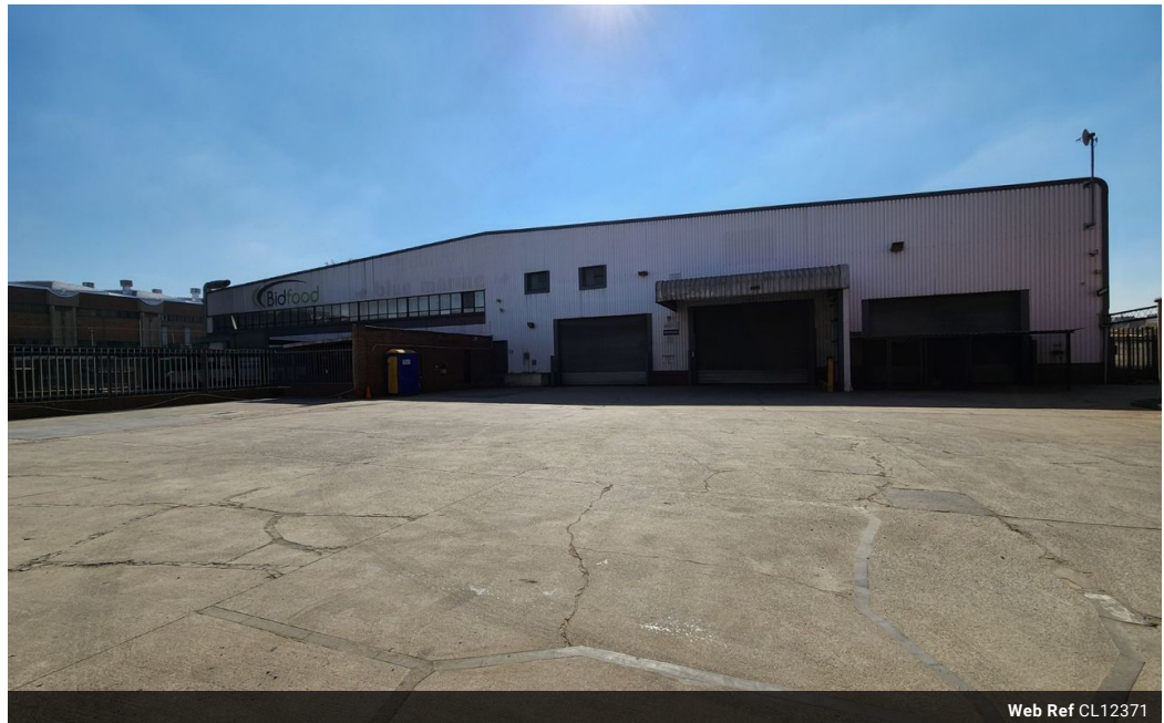
Web Ref CL12371

Office 40A Eden Meadows Complex 1 Van Riebeeck Avenue Greenstone 1609