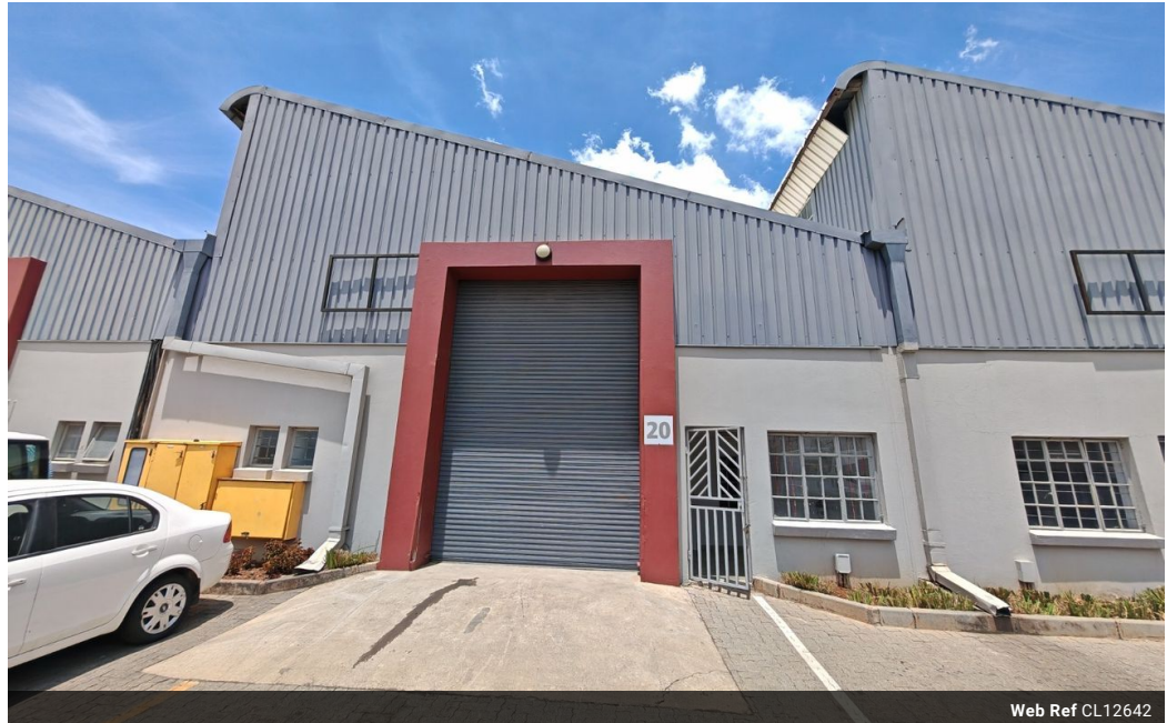
Web Ref CL12642

Office 40A Eden Meadows Complex 1 Van Riebeeck Avenue Greenstone 1609