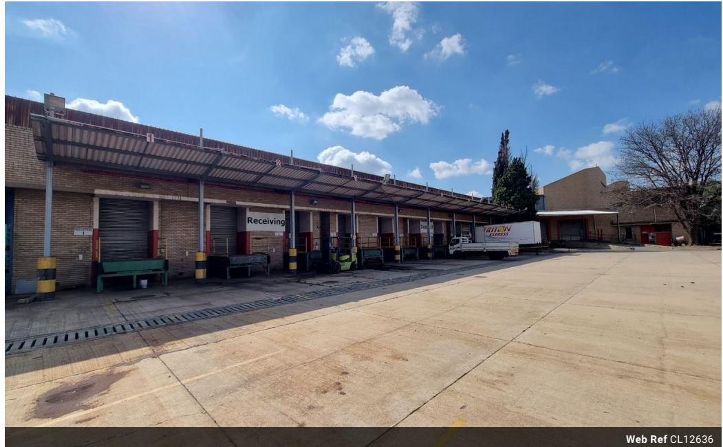
Web Ref CL12636

Office 40A Eden Meadows Complex 1 Van Riebeeck Avenue Greenstone 1609