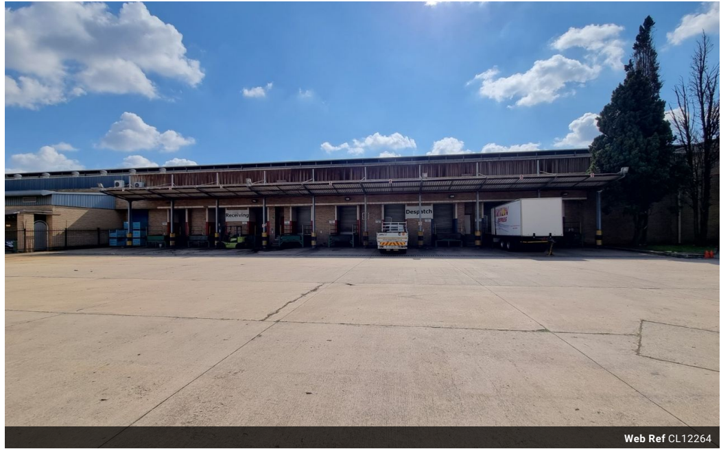
Web Ref CL12264

Office 40A Eden Meadows Complex 1 Van Riebeeck Avenue Greenstone 1609