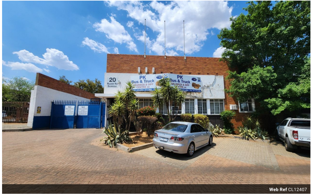
Web Ref CL12407

Office 40A Eden Meadows Complex 1 Van Riebeeck Avenue Greenstone 1609