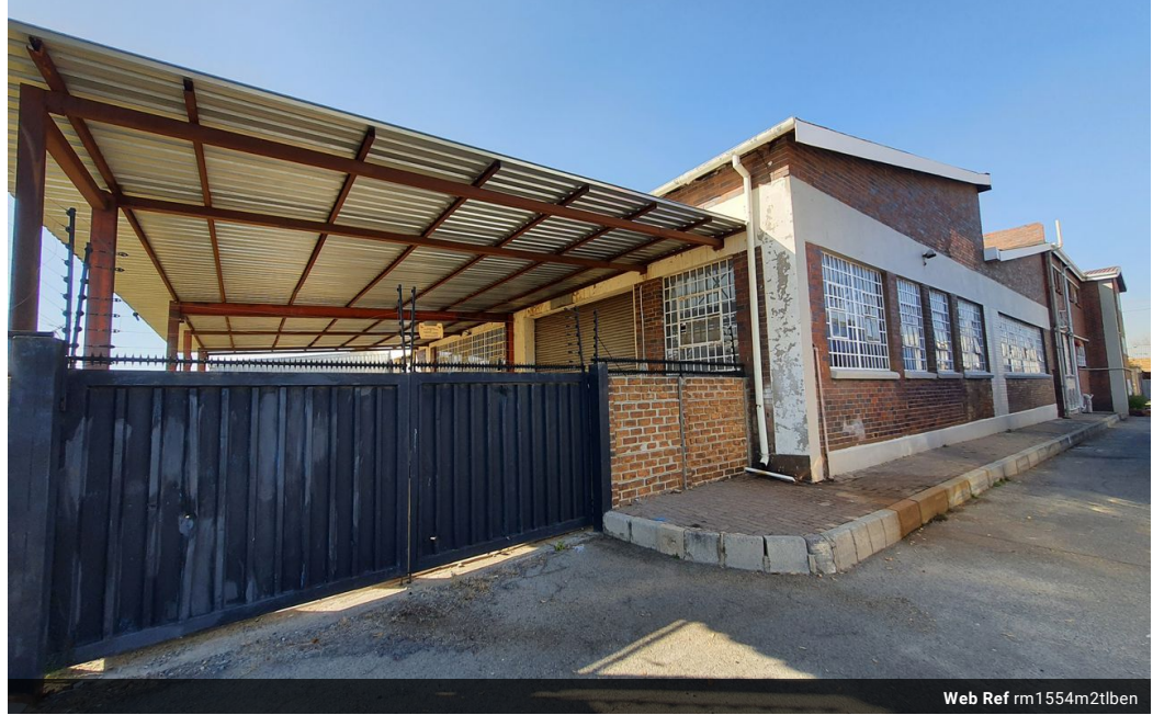
Web Ref rm1554m2lben

Office 40A Eden Meadows Complex 1 Van Riebeeck Avenue Greenstone 1609