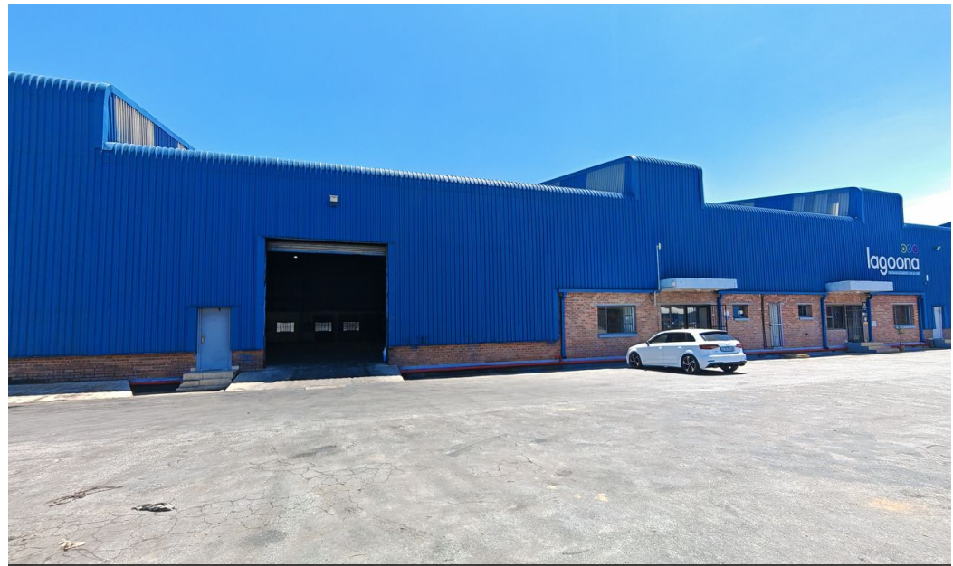
Web Ref JP1092TLA

Office 40A Eden Meadows Complex 1 Van Riebeeck Avenue Greenstone 1609