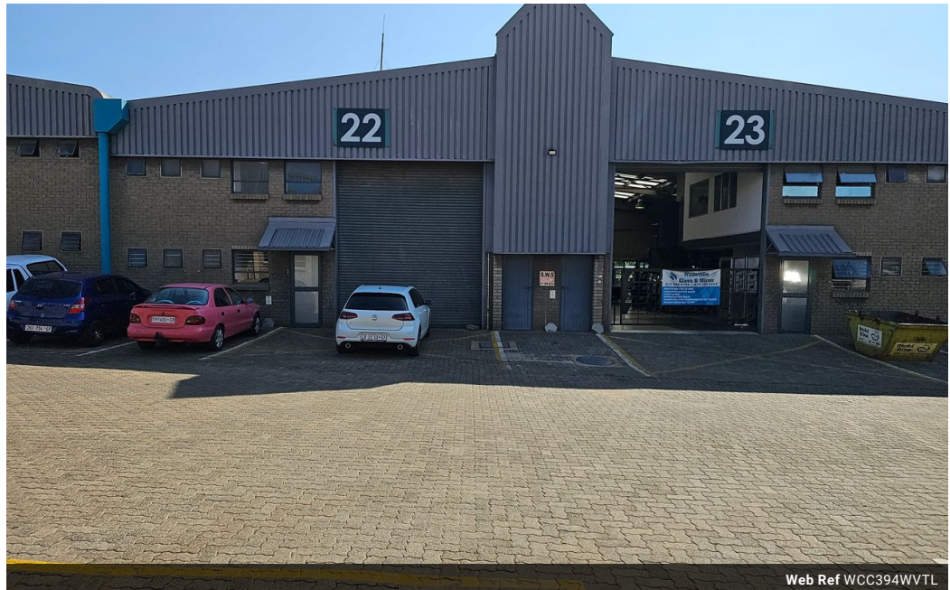
Web Ref WCC394WVTL

Office 40A Eden Meadows Complex 1 Van Riebeeck Avenue Greenstone 1609