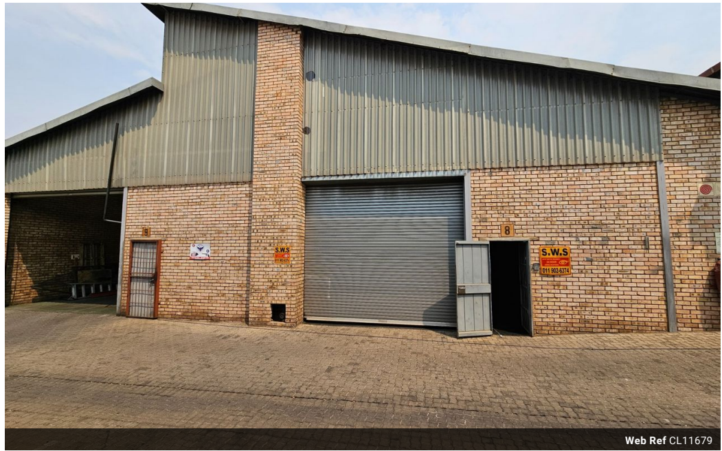
Web Ref CL11679

Office 40A Eden Meadows Complex 1 Van Riebeeck Avenue Greenstone 1609