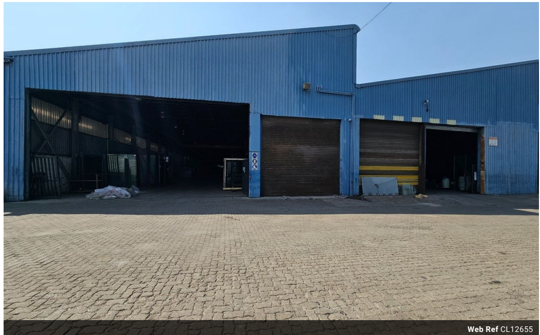
Web Ref CL12655

Office 40A Eden Meadows Complex 1 Van Riebeeck Avenue Greenstone 1609