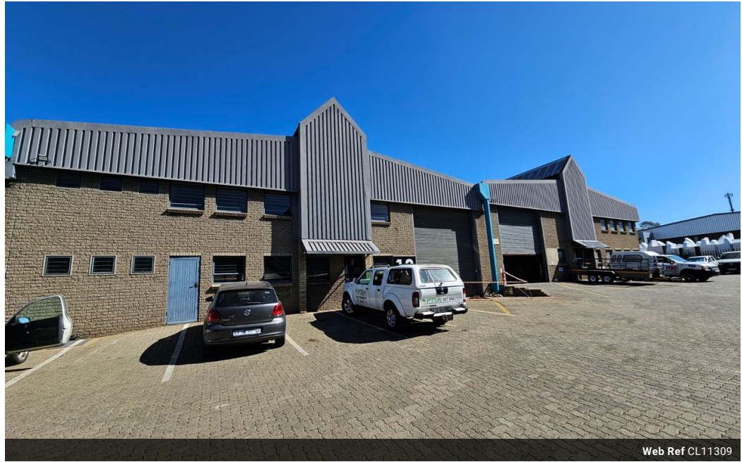
Web Ref CL11309

Office 40A Eden Meadows Complex 1 Van Riebeeck Avenue Greenstone 1609