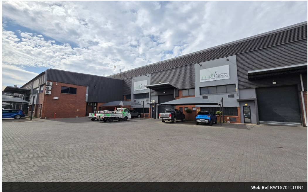
Web Ref BW1570TLTUN1

Office 40A Eden Meadows Complex 1 Van Riebeeck Avenue Greenstone 1609