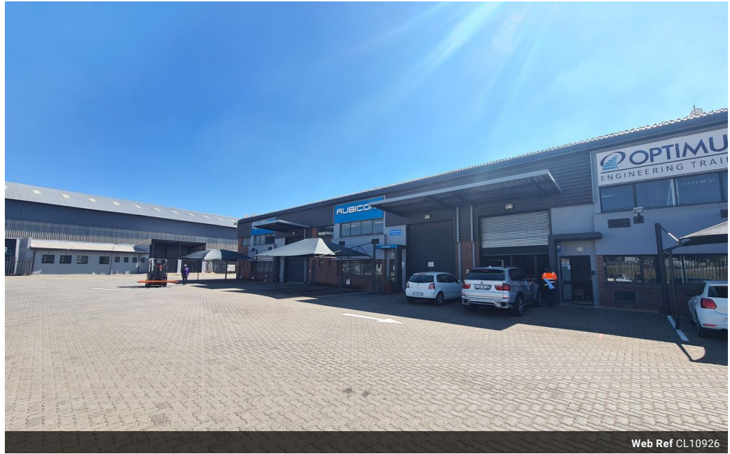
Web Ref CL10926

Office 40A Eden Meadows Complex 1 Van Riebeeck Avenue Greenstone 1609