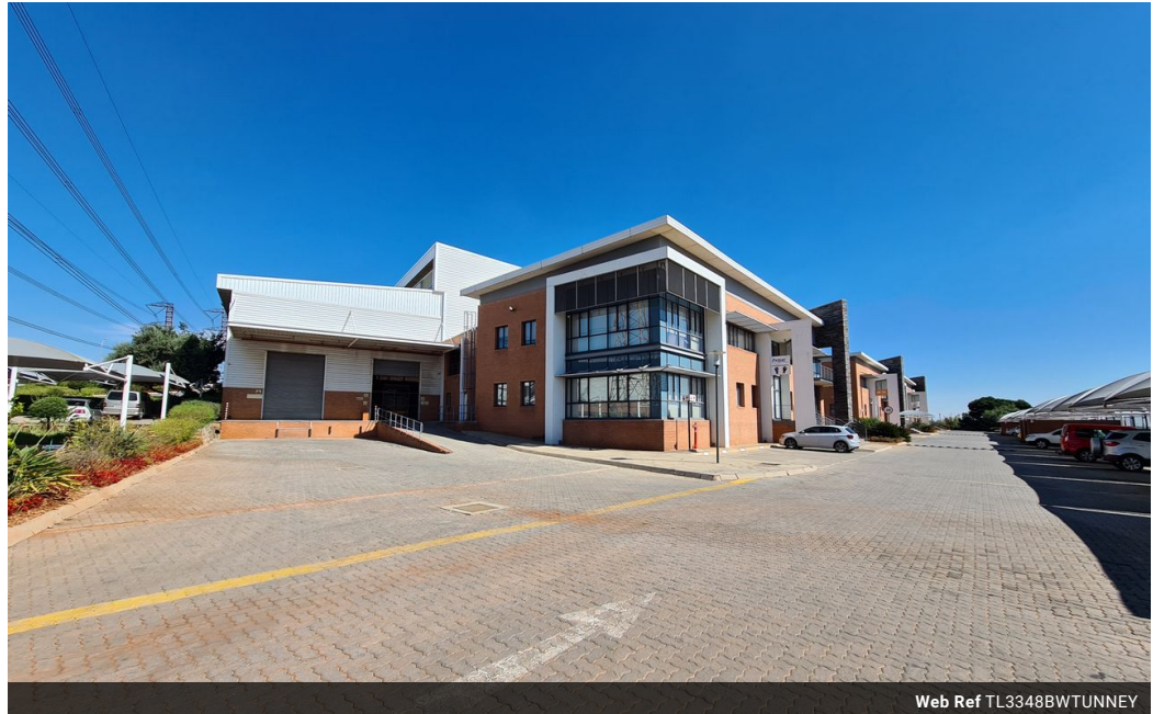
Web Ref TL3348BWTUNNEY

Office 40A Eden Meadows Complex 1 Van Riebeeck Avenue Greenstone 1609