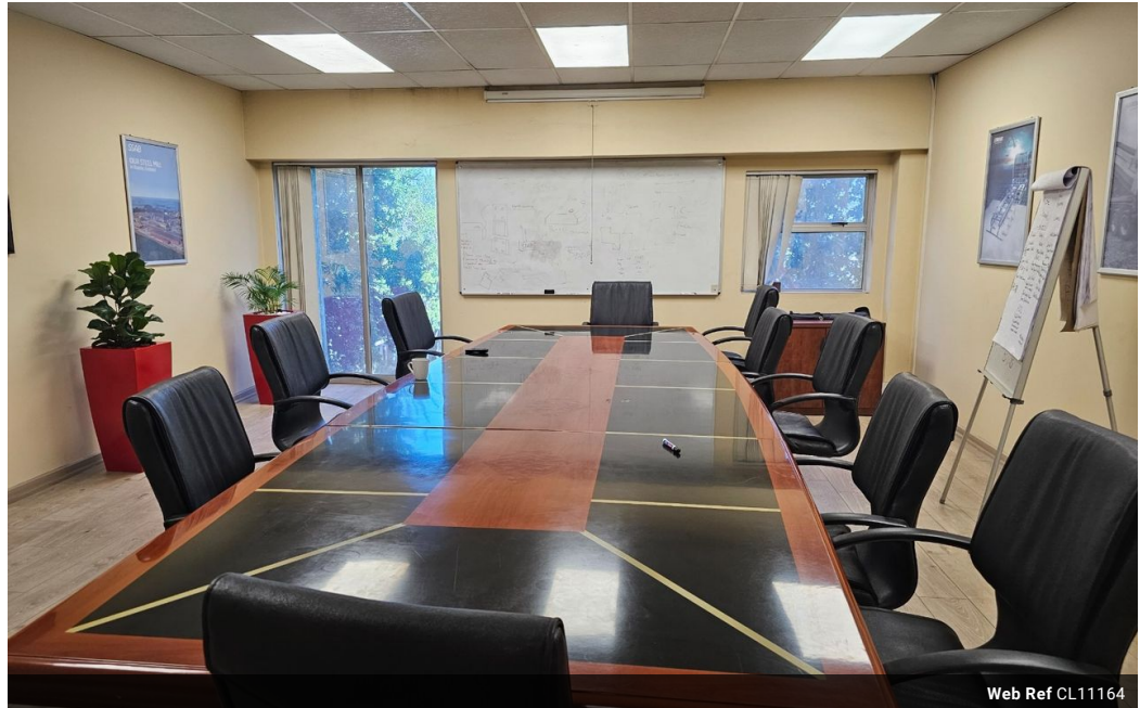
Web Ref CL11164

Office 40A Eden Meadows Complex 1 Van Riebeeck Avenue Greenstone 1609