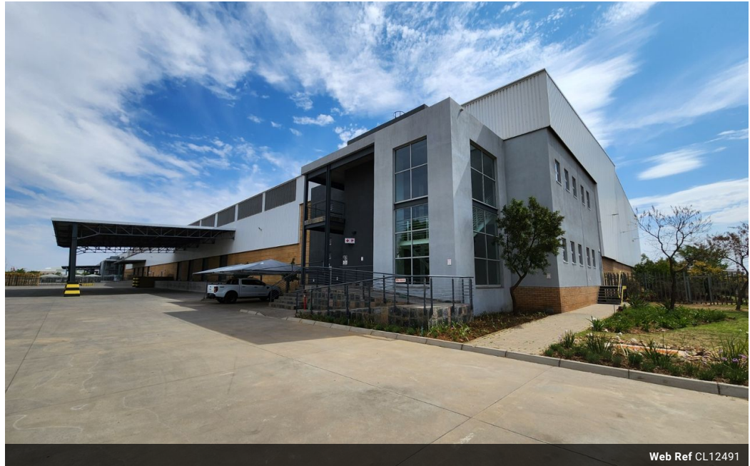
Web Ref CL12491

Office 40A Eden Meadows Complex 1 Van Riebeeck Avenue Greenstone 1609