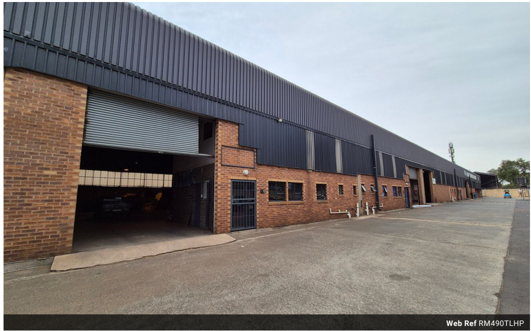
Web Ref RM490TLHP

Office 40A Eden Meadows Complex 1 Van Riebeeck Avenue Greenstone 1609