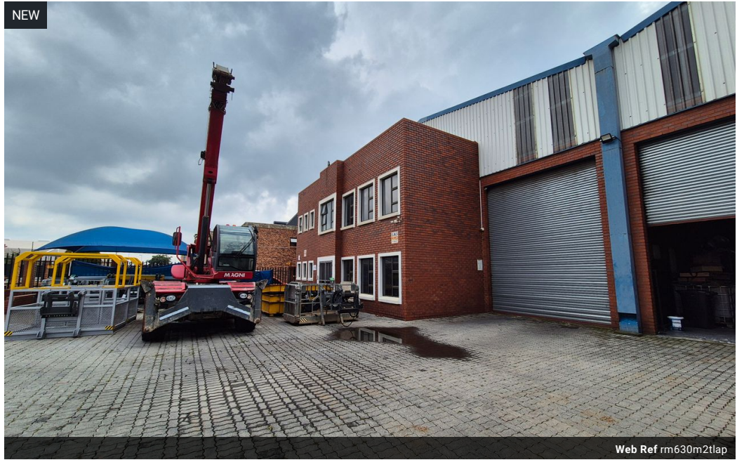
Web Ref rm630m2lap