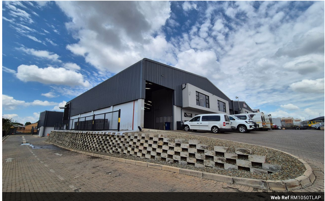
Web Ref RM1050TLAP

Office 40A Eden Meadows Complex 1 Van Riebeeck Avenue Greenstone 1609