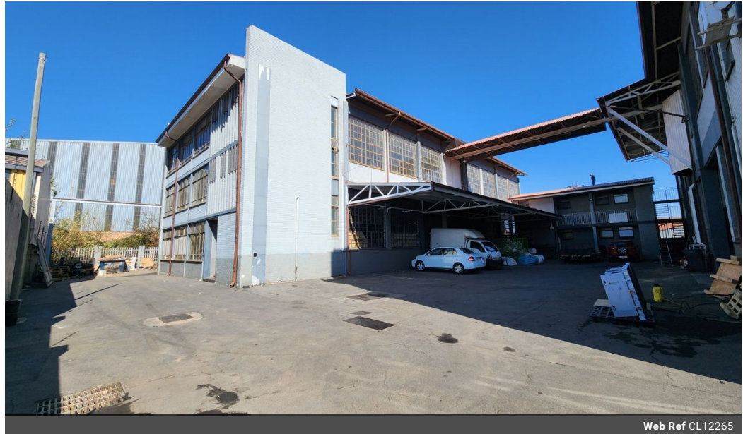
Web Ref CL12265

Office 40A Eden Meadows Complex 1 Van Riebeeck Avenue Greenstone 1609