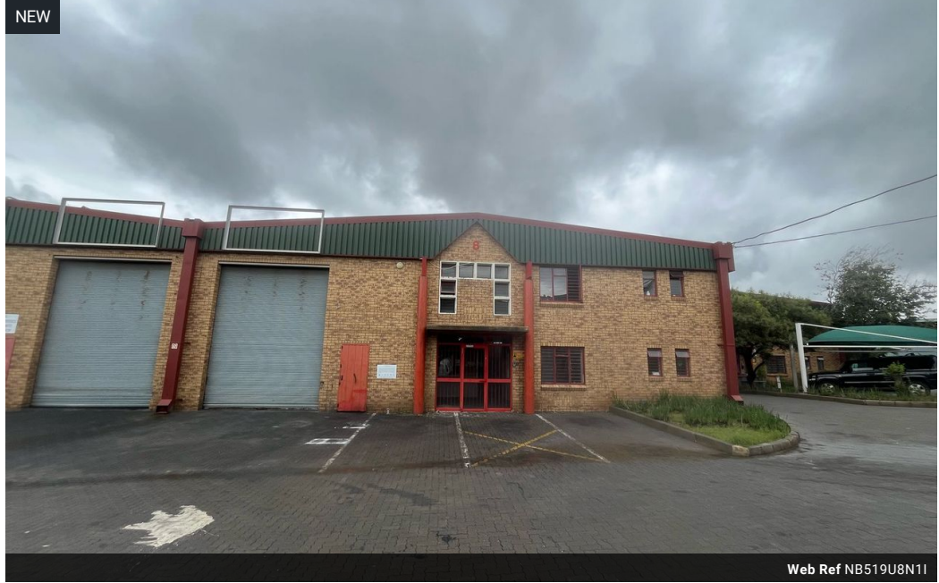
Web Ref NB519U8N11

Office 40A Eden Meadows Complex 1 Van Riebeeck Avenue Greenstone 1609