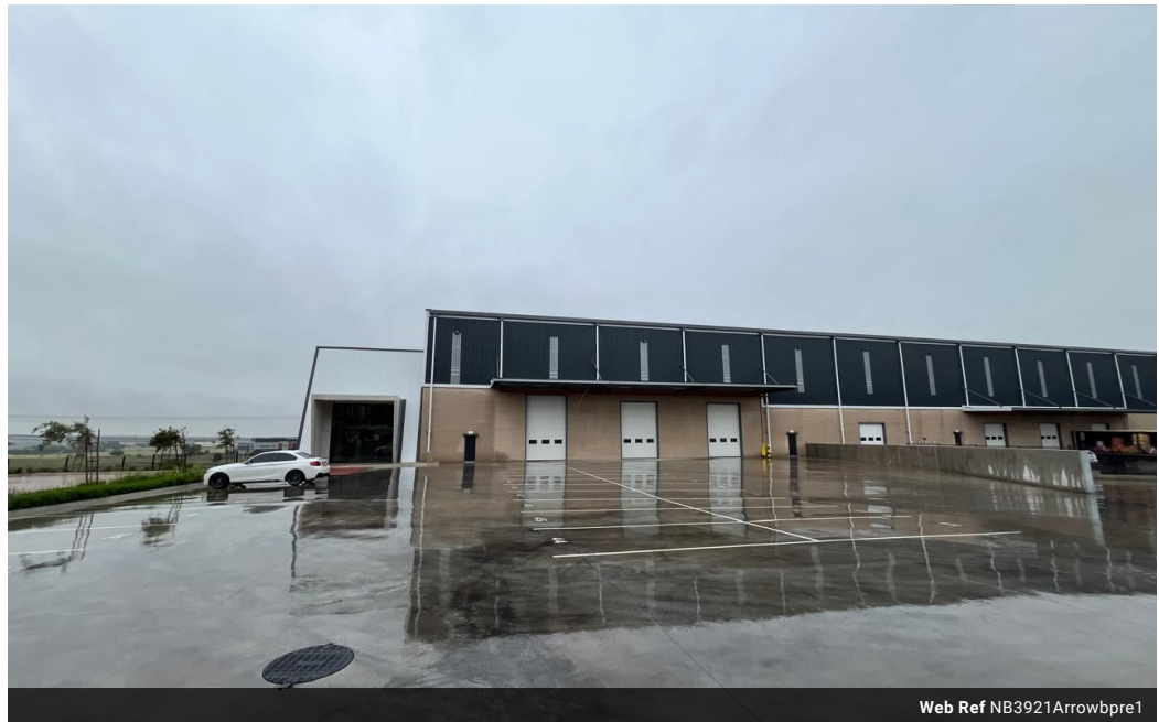
Web Ref NB3921Arrowbpre1

Office 40A Eden Meadows Complex 1 Van Riebeeck Avenue Greenstone 1609