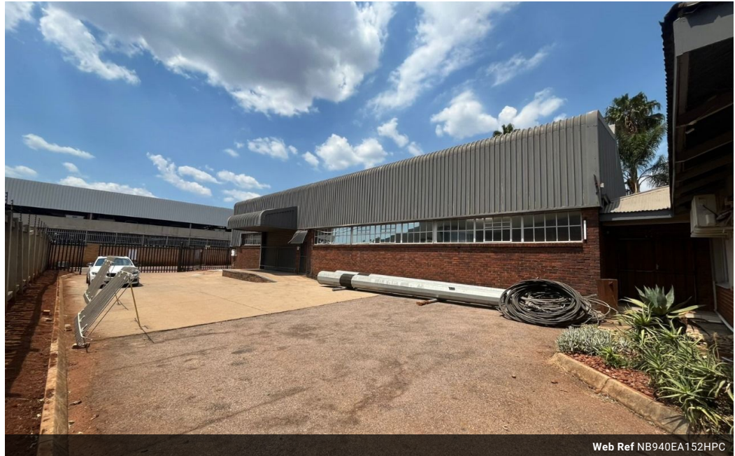
Web Ref NB940EA152HPC

Office 40A Eden Meadows Complex 1 Van Riebeeck Avenue Greenstone 1609