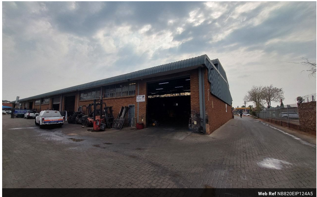
Web Ref NB820EIP124A5

Office 40A Eden Meadows Complex 1 Van Riebeeck Avenue Greenstone 1609