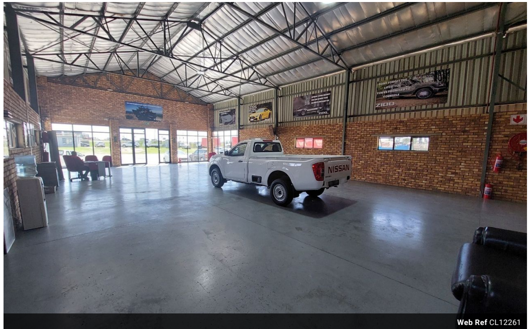
Web Ref CL12261

Office 40A Eden Meadows Complex 1 Van Riebeeck Avenue Greenstone 1609