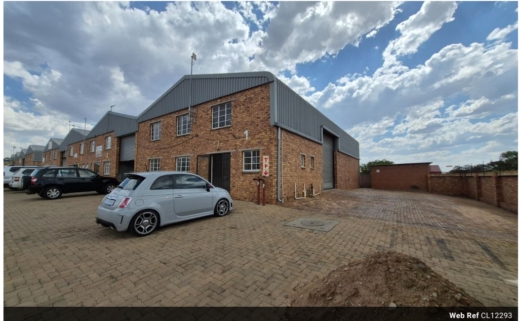
Web Ref CL12293

Office 40A Eden Meadows Complex 1 Van Riebeeck Avenue Greenstone 1609