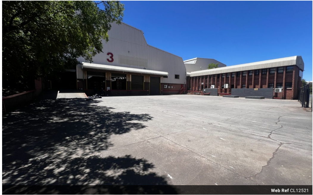
Web Ref CL12521

Office 40A Eden Meadows Complex 1 Van Riebeeck Avenue Greenstone 1609