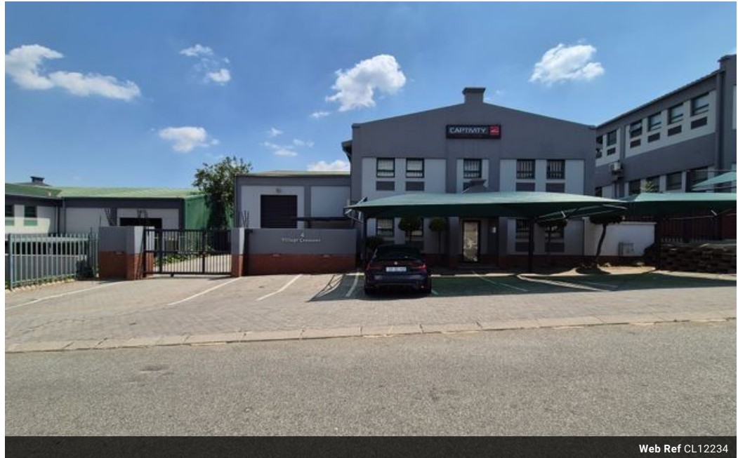
Web Ref CL12234

Office 40A Eden Meadows Complex 1 Van Riebeeck Avenue Greenstone 1609