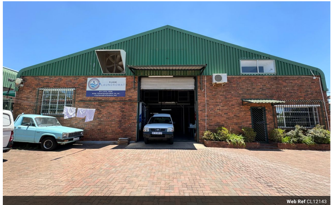
Web Ref CL12143

Office 40A Eden Meadows Complex 1 Van Riebeeck Avenue Greenstone 1609