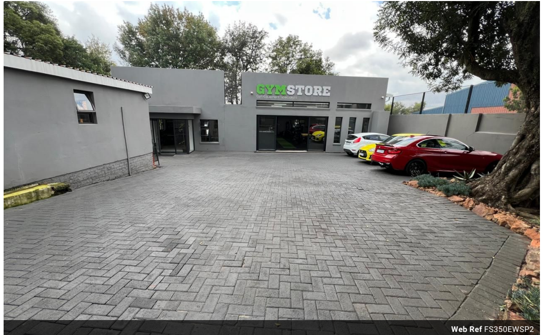
Web Ref FS350EWSP2

Office 40A Eden Meadows Complex 1 Van Riebeeck Avenue Greenstone 1609