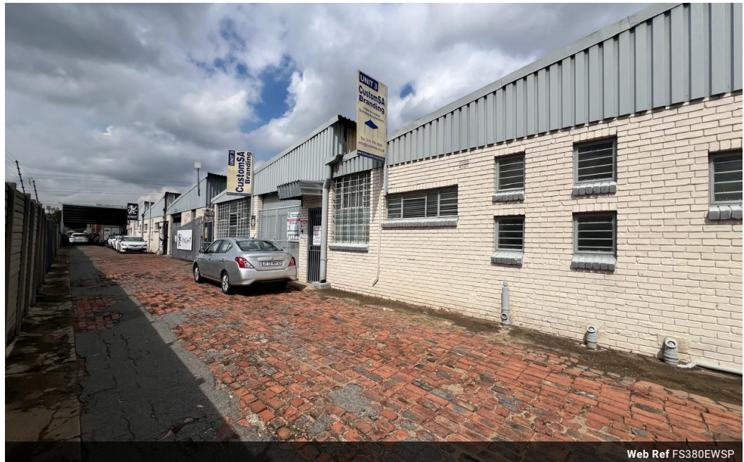
Web Ref FS380EWSP

Office 40A Eden Meadows Complex 1 Van Riebeeck Avenue Greenstone 1609