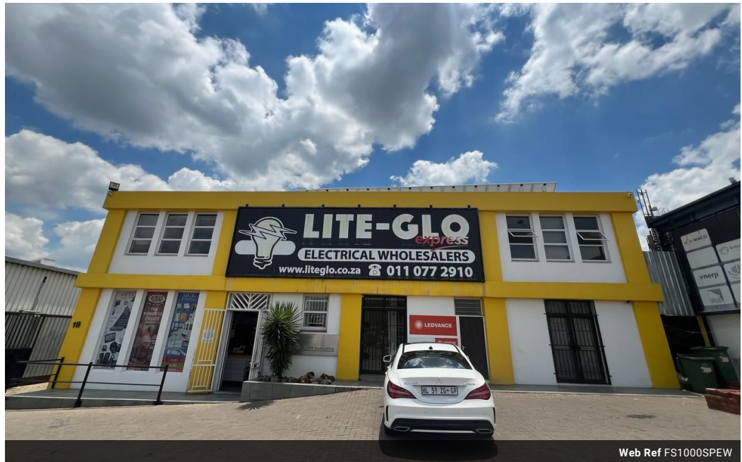
Web Ref FS1000SPEW

Office 40A Eden Meadows Complex 1 Van Riebeeck Avenue Greenstone 1609